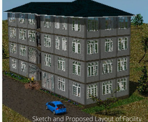
Sketch and Proposed Layout of Facility